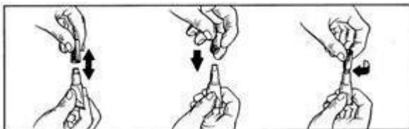
Figure 1: Opening a tube

Remove one tube from the package. Hold the tube in an upright position, twist and pull off cap. Use reversed cap to twist and remove seal from tube. See Figure 1.